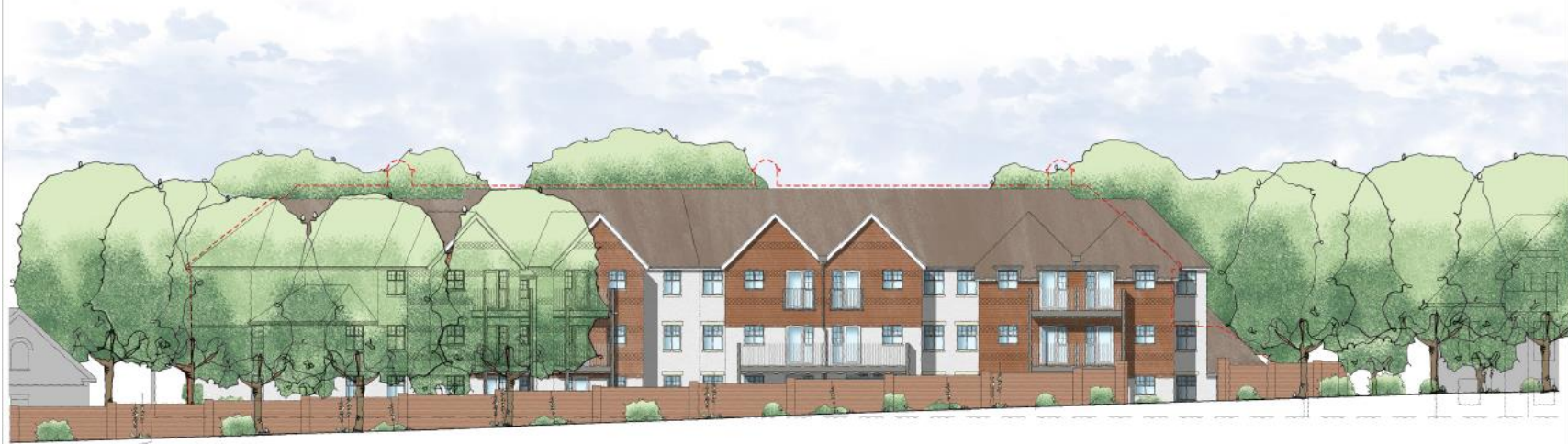
View from London Road

--- Highest Outline of existing planning approved scheme shown during